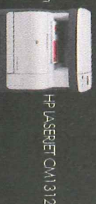
HP LASERJET CM1312

Todos los derechos reservados. ©2008 Hewlett-Packard Development Company, L.P.