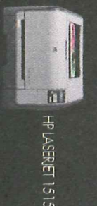
HP LASERJET 1515n