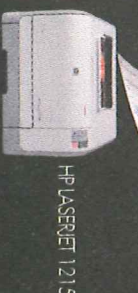
HP LASERJET 1215