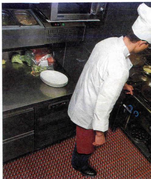
"IT'S NOT THE WALKING... IT'S THE STANDING."

Understanding the important relationship chefs, their shoes and the matting on wh