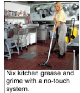
Nix kitchen grease and grime with a no-touch system.