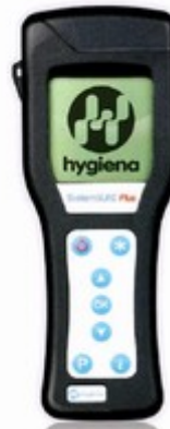
Click Here to Enlarge Picture

November 27, 2007 - Designed to gauge performance of cleaning processes, SystemSURE Plus sanitation monitoring system detects both microbial and non-microbial contamination in 15 seconds, allowing cleaning professionals to verify cleaning on-the-spot and record results.