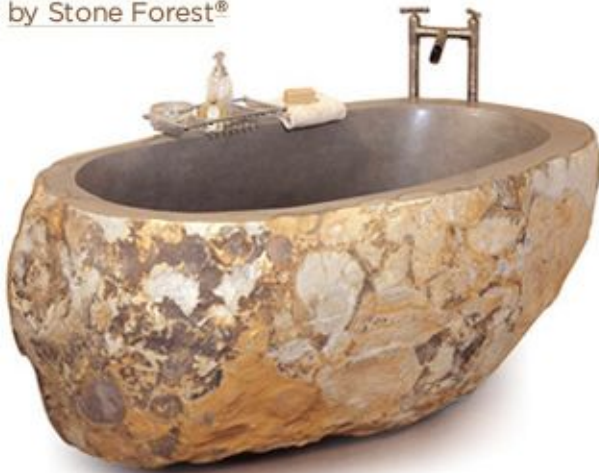
Natural Bathtub by Stone Forest®

Tired of ceramic? Punch your bath up with the latest tub trends -- wood, granite, and stone.