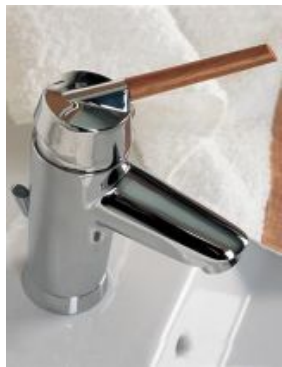
Natural wood warms the chrome finish of this Ramon Soler faucet.