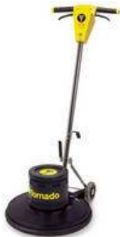
You Want Tough... You Got It